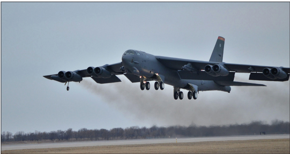
A B-52 bomber takes off at Minot Air Force Base in this file photo.

SkyWest is also investigating the incident, according to a July 20 statement from the company. “SkyWest flight 3788, operating as Delta Connection from Minneapolis, Minnesota to Minot, North Dakota on July 18, landed safely in Minot after being cleared for approach by the tower but performed a go-around when another aircraft became visible in their flight path. We are investigating the incident,” the release said. A video posted to Instagram by passenger Monica Green documented the “go-around.”