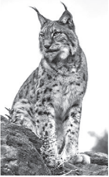
One per season- restricted