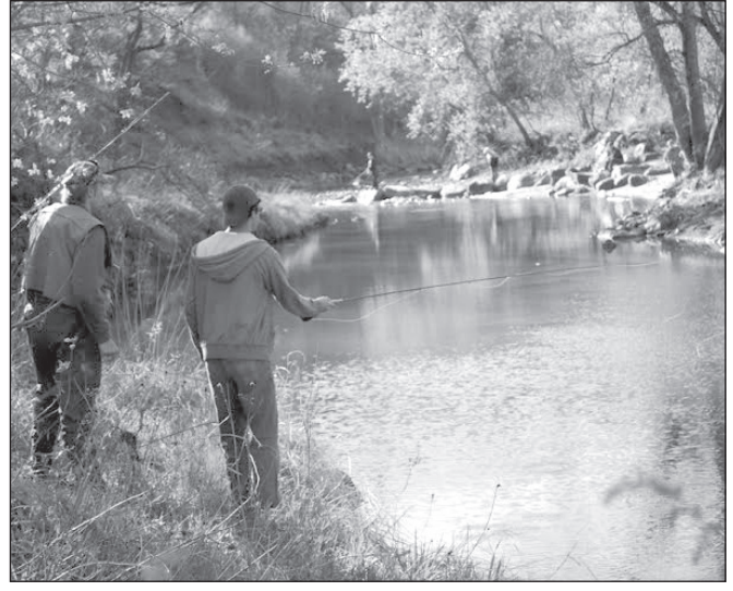
Forecasting Growth. Instilling a love for angling and helping another person grow in the outdoors can be as easy as going fishing and sharing what you know about a certain species, method or water.

What I've found out about most anglers is they love to talk in generalities, and hold back on specifics, and