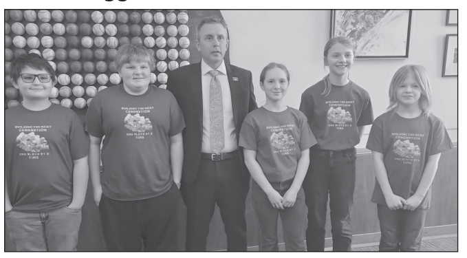
Armstrong Group Picture: Students were lucky to see governor Kelly Armstrong's office and get a picture.