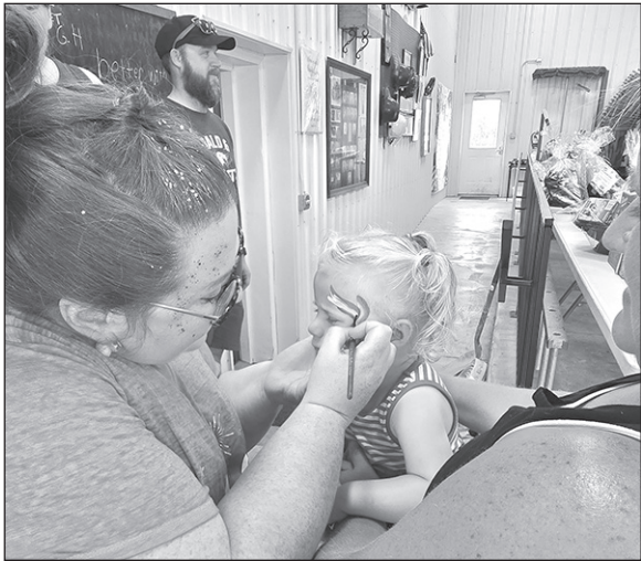
Story Nook of Jamestown does free face painting provided by the Gackle Park Board.