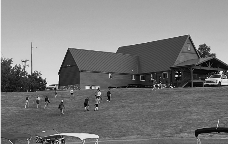
Everyone heading to get some ice cream for the boat ride