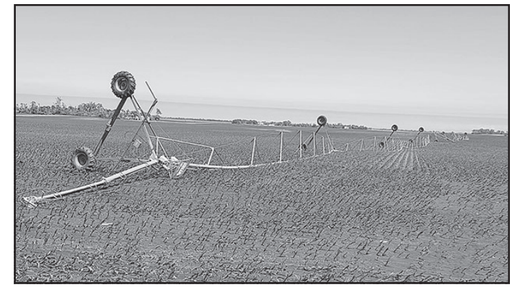
Safety is always the top priority while examining a storm-damaged irrigation system.