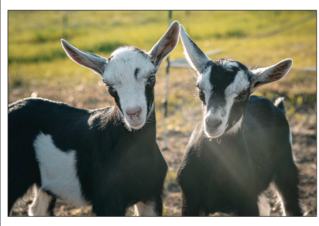
THE STARS OF THE SHOW at Naturez Girl Ranch are the lovable goats.