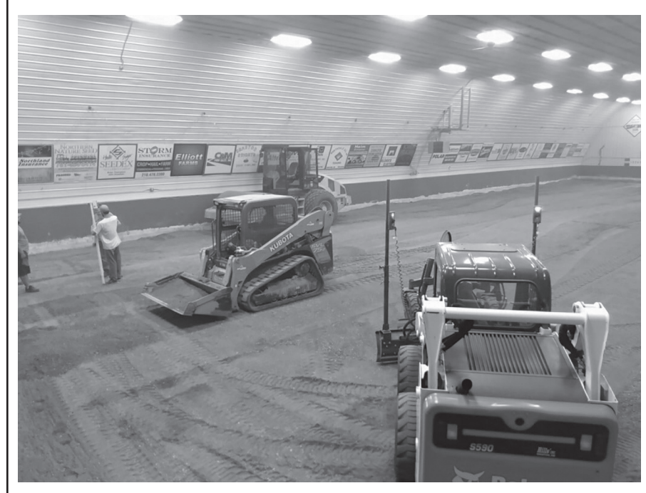
The flooring was replaced entirely during the renovation.