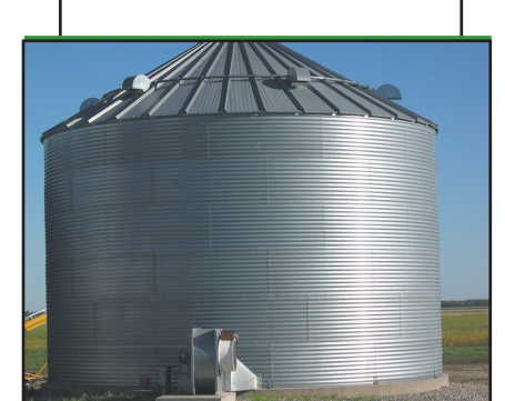
AG: Grain monitoring critical this time of year PG. 2