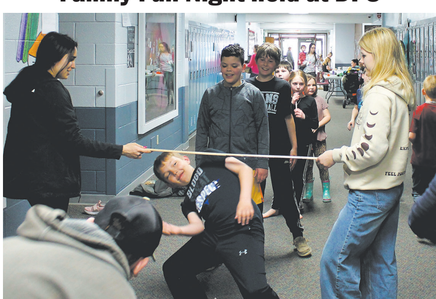
High school students helped with a limbo contest in the halls during Drayton School's family night.