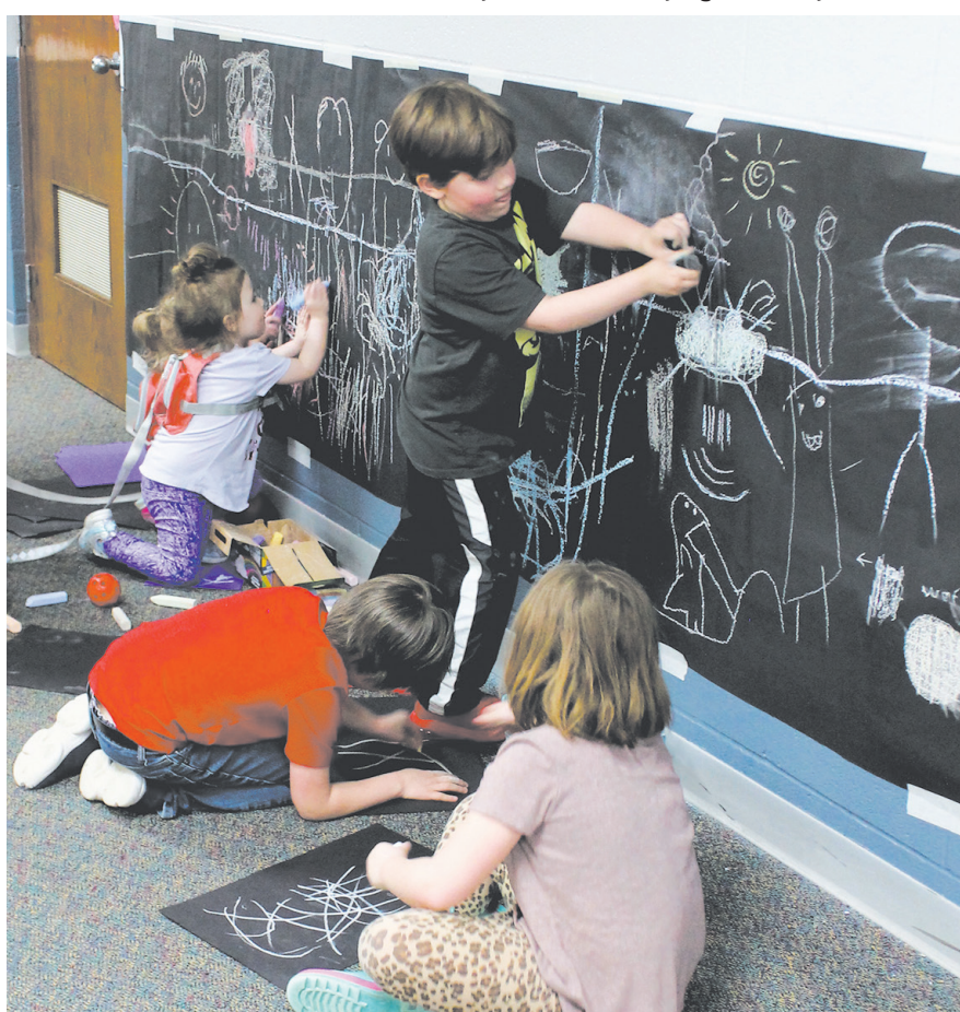
Chalk the halls was a hit at Drayton School's family night.