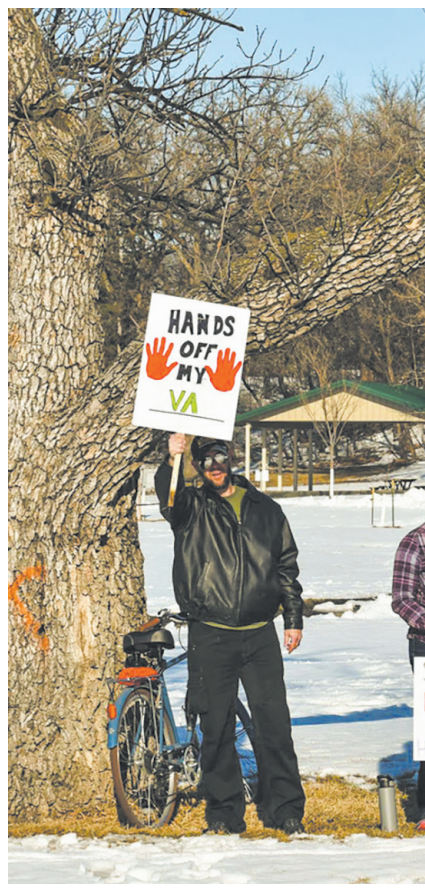
Locals voice support for veterans at a Hands Off protest near the Veterans Memorial Bridge between Fargo and Moorhead on April 5. Approximately 2,000 people attended the rally voicing opposition to a variety of actions of the new Trump administration.

Expected cuts of between 70.000 The Associated Press reported on the to over 80,000 workers from U.S. Department of Veterans Affairs to bring staffing down to 2019 levels by the end of August have some North