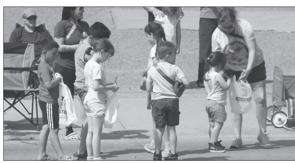
Young children scrambled for candy, which was offered by several of the floats during

Part of the Band Day festivities included activities and more at Harmon Park, where 19 food vendors and 25 craft/product vendors, along with a number of inflatables helped to make the afternoon memorable.