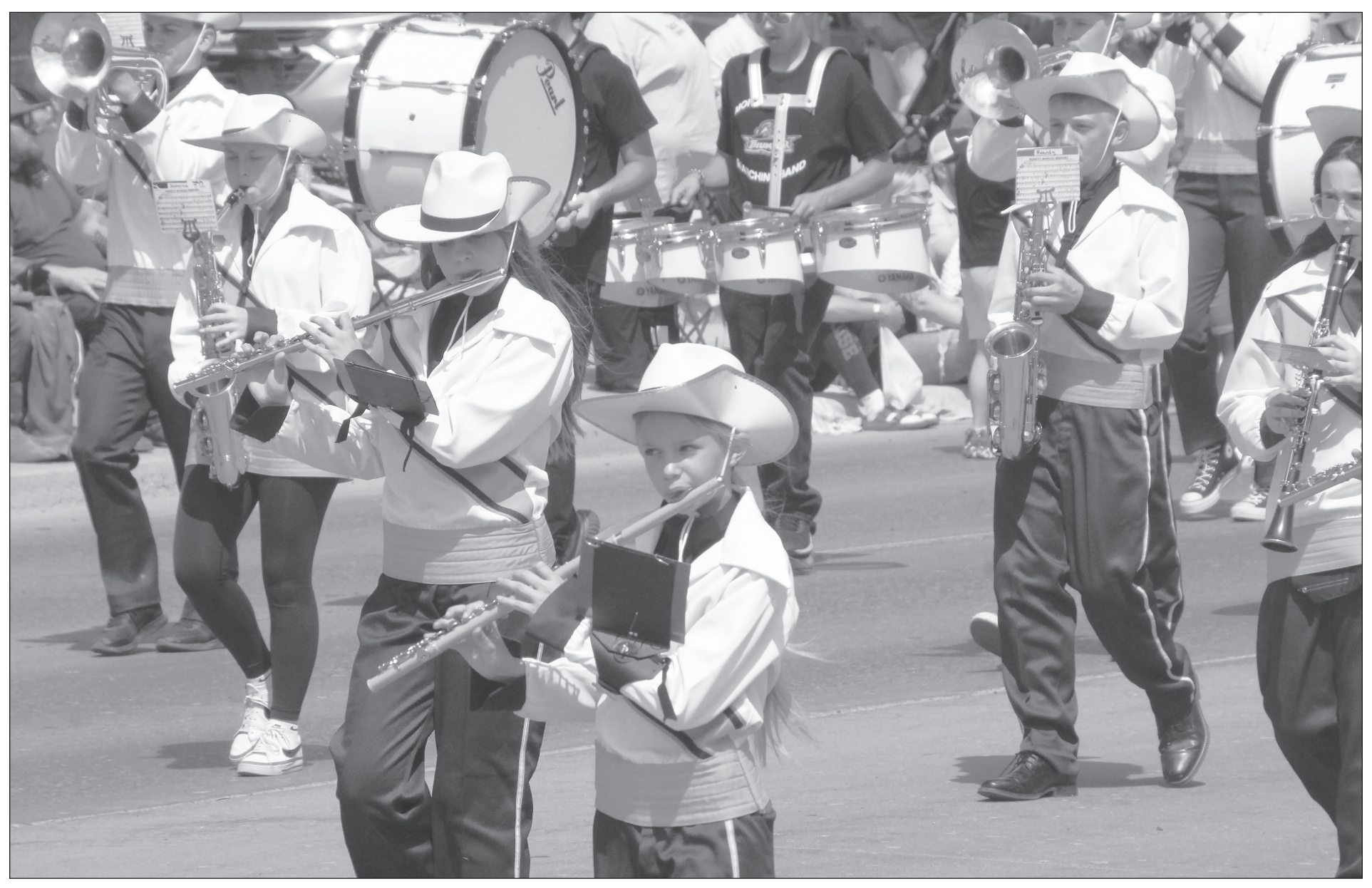
Members of the Grenora/Westby Mondak Thunder Marching Band march down 2nd Street West.