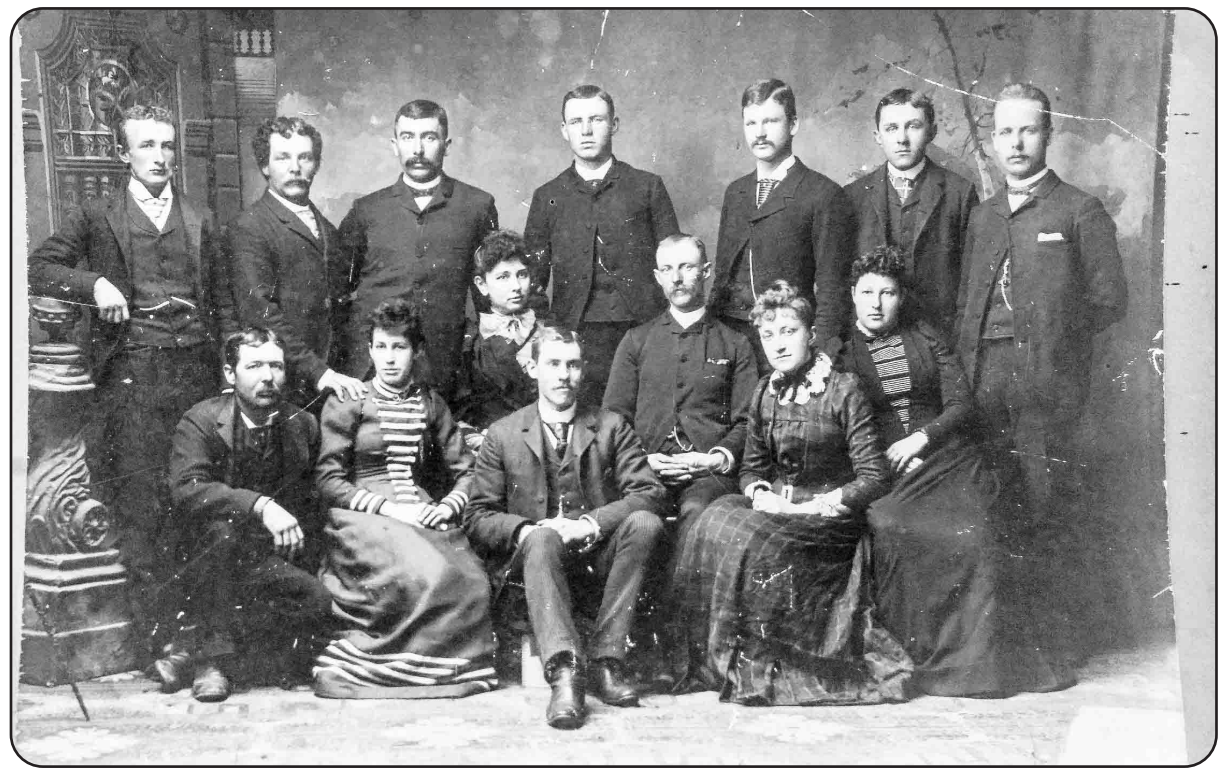
"The Yorktown Dramatic Club '90 and '91" is the designation for this historic photo that recalls the theatrical ambitions of the townsfolk of a mostly forgotten town that was located east of Fullerton. This scene is a reminder that human motivation and talent comes prior to elaborate buildings such as the Ellendale Opera House. Drama clubs like this flourished in small Dakota towns even while the towns' basic physical

Though their Ellendale connections evidently faded,